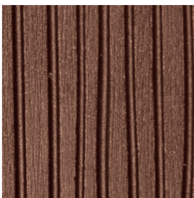
marrone ramato copper brown