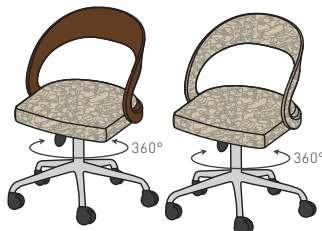
GFK PH R GFK PO R girado swivel chair