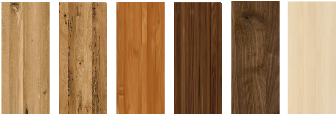
wild oak white oil *)