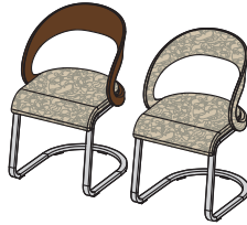
GFS PO GFS PH girado cantilever chair